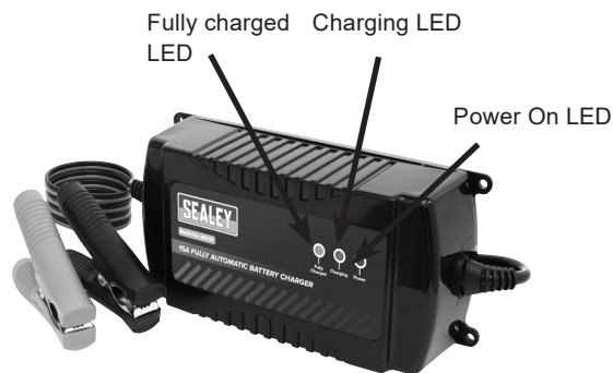
fig.2 SBC8, SBC15